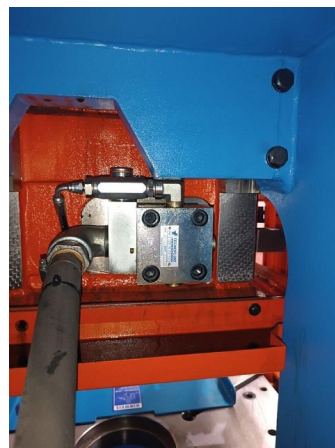
Hydraulic safety valve