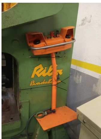
2 hand pedistal